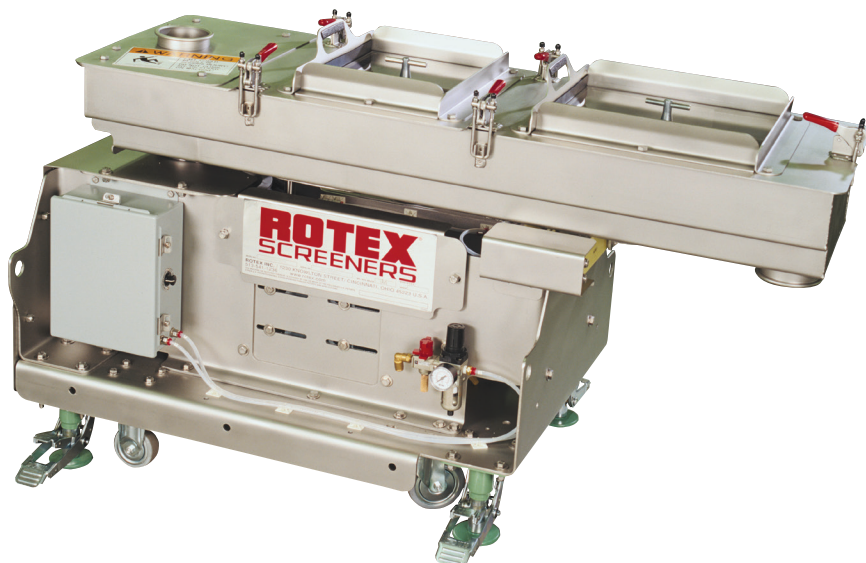
Plastic Pellet Screener

The competitively priced pellet screeners from Rotex are designed to address the needs of compounders who require the accurate removal of off-size material with quick and easy set up between batches.