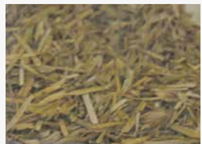
➤ Aspirated Particles