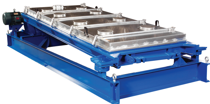
▲ Rotex® Screener Unit operating since 1992 in granulated urea.