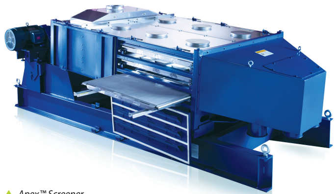
▲ Apex™ Screener Newly adopted by the granulated urea industry.