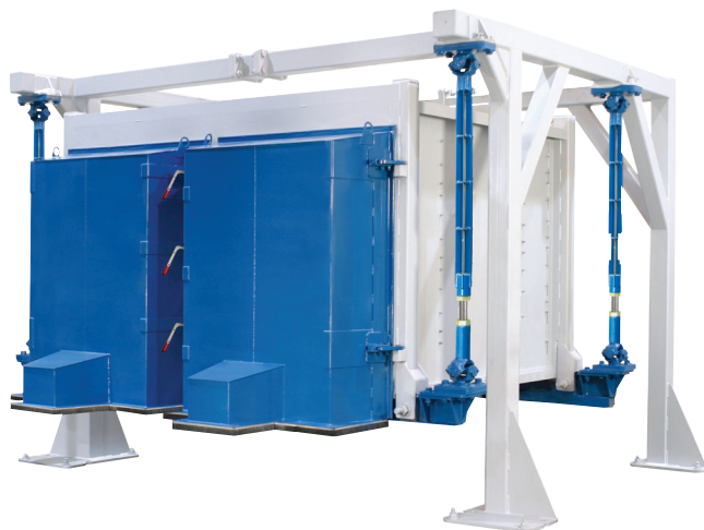
▲ Minerals Separator™ Unit operating since 2009 in granulated urea.

Rotex can offer granulated urea producers complete urea systems and solutions including: safety screens, distribution feeders, granulator extractors and flapper valve assemblies.