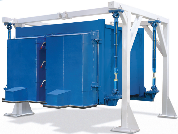
Minerals Separator/MEGATEX XD

The Rotex Minerals Separator and MEGATEX XD provide unmatched industrial screening for high-volume applications requiring extremely accurate separations. These multilevel separators feature unique stacked designs for smaller footprints and were engineered to withstand the harshest of conditions.