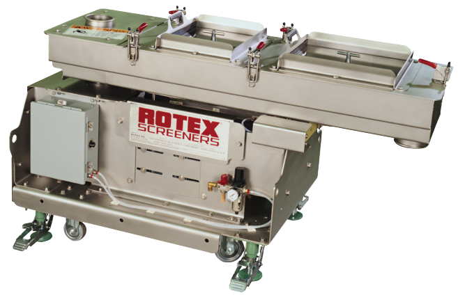
▲ Plastic Pellet Screener