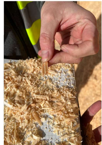
Good pulp material in a fines bunker in a Scandinavian sawmill.

The Rotex Group's BM&M brand offers technology with higher speeds and larger machine sizes to accommodate today's modern saws and profiling lines. First, higher speeds in a true gyratory motion induce more energy into the screen, thus keeping the necessary smaller hole sizes from plugging. Secondly, due to the balanced design of BM&M machines, brand engineers are able to design larger screening decks capable of handling the larger volumes