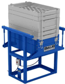
BM&M Chip Classifier using SCAN standard trays.

Typically, 6.35mm woven wire mesh is used to achieve the best results according to material loss. According to the SCAN Norm, larger holes mean users are wasting a fraction of small accepts, like shown in the figure below.