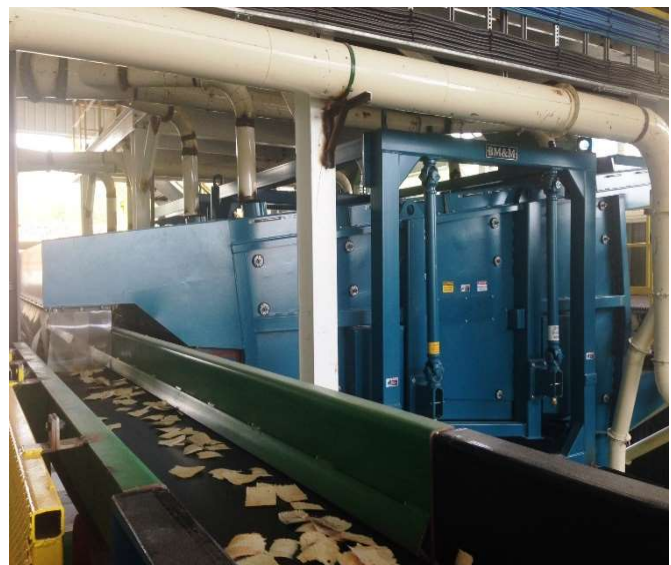
A modern BM&M Counterflow Chip Screen used in a wood chip screening application.