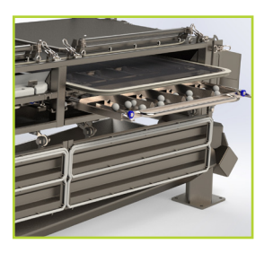
Toolless Ball Tray Minimizes downtime for ball tray installation / removal and can be completed by a single operator.