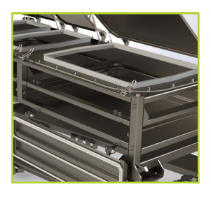
Screener Top, side and discharge-end access for quick cleaning without the need for tools to disassemble.