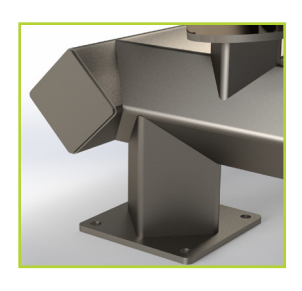
Sanitary Design Designed to be compliant with USDA, EHEDG, and FSMA requirements.