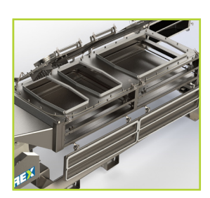
Washdown Capable No internal flat surfaces or ledges provides selfdraining capabilities when washdown is necessary.