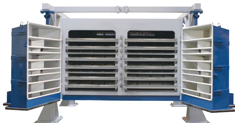
▲ Minerals Separator™ Full Size Model