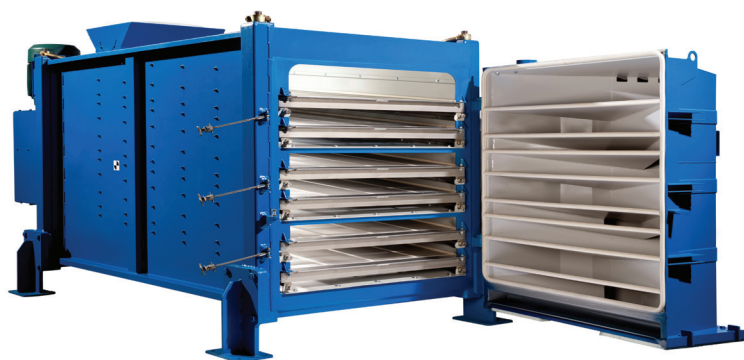
▲ Minerals Separator™ Half Size Model